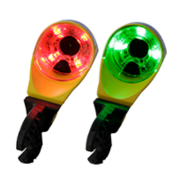
Voltage presence indication / No voltage indication