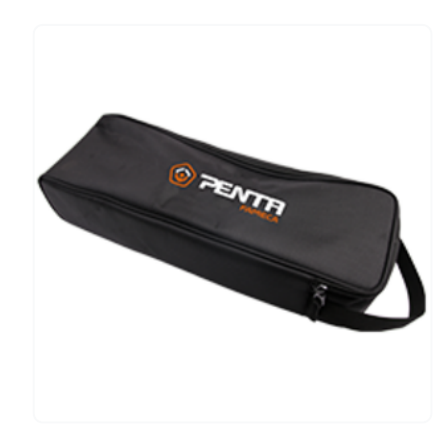
Soft case with conductive lining for EMC protection

Document not contractually binding, errors and omissions excepted